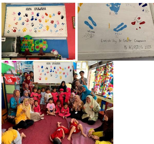
Figure 4. Results of English Day for Golden Generation activities

strengthen the abilities and vocabulary of SPS Mawar Kebonagung's early childhood children in English so that they can have good basic English skills when they start school.