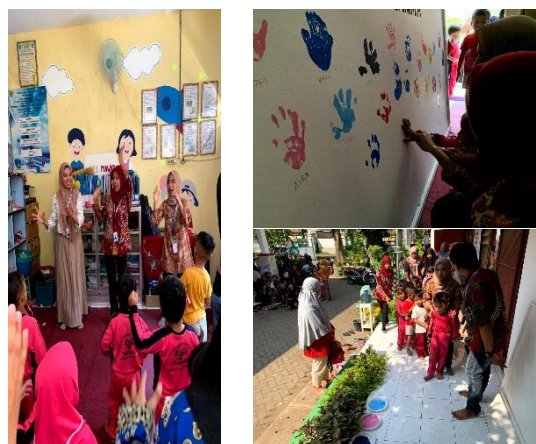
Figure 3. English Day Activities Using Game Media

English Day activities emphasize introducing vocabulary in AUD so that the English Day work program implementation focuses on early childhood.