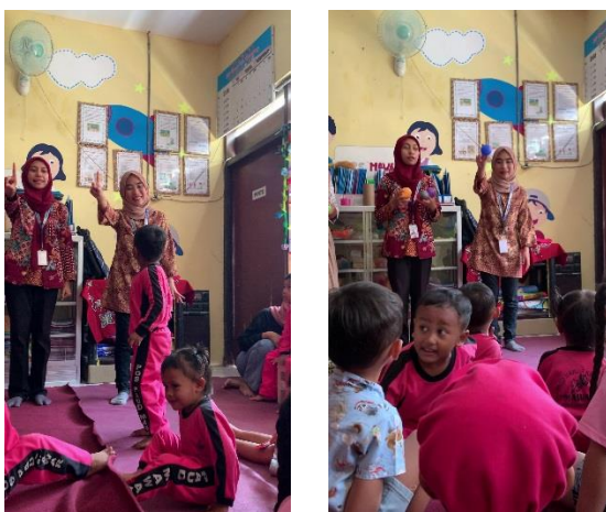
Figure 2. English Day Activities Using Song Media

Learning in an exciting and fun way improves AUD learning outcomes. Teaching English to AUDs by combining learning skills through fun play is very important to support learning English vocabulary (Akmaliyah, 2021; McClain, 2020). If AUD likes learning, then they will be motivated to take part in learning so they can learn well.